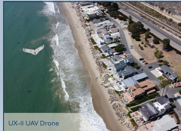
UX-II UAV Drone

Unmanned Aerial Vehicle (UAV) drones are undertaking complex operations with great ease. From as-built mapping and topographic surveys, to vegetation & habitat mapping, UAV drones capture data with incredible speed and accuracy.